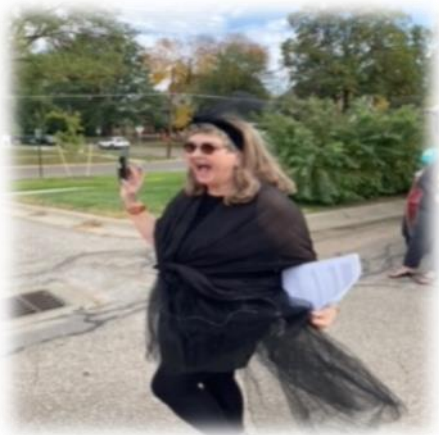
SO excited for Trunk-or-Treat!!!

Sunday, October 22 we hosted our first ever Trunk-or-Treat! It was well attended with approximately 300 participants enjoying the wonderful fall weather. Enjoy a few of the moments that were captured as we enjoyed a wonderful fellowship experience.