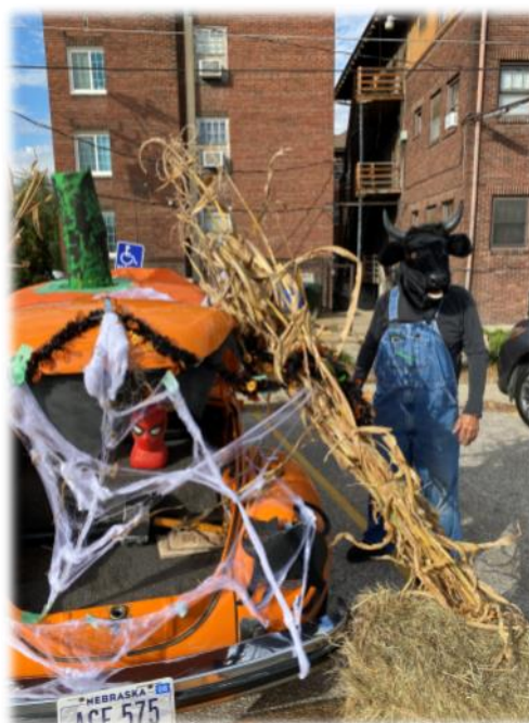
It's the Great Pumpkin