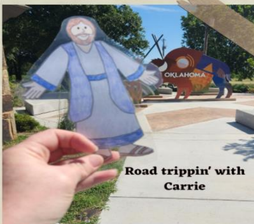
Road trippin' with Carrie