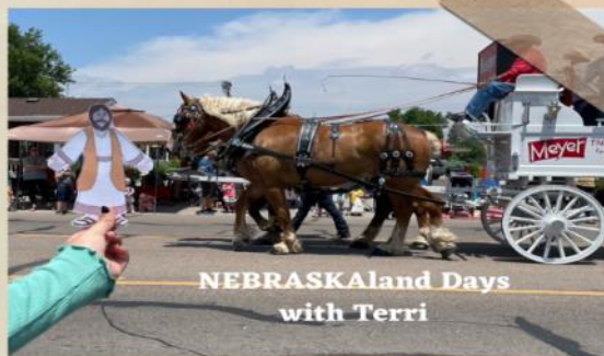
NEBRASKALand Days with Terri